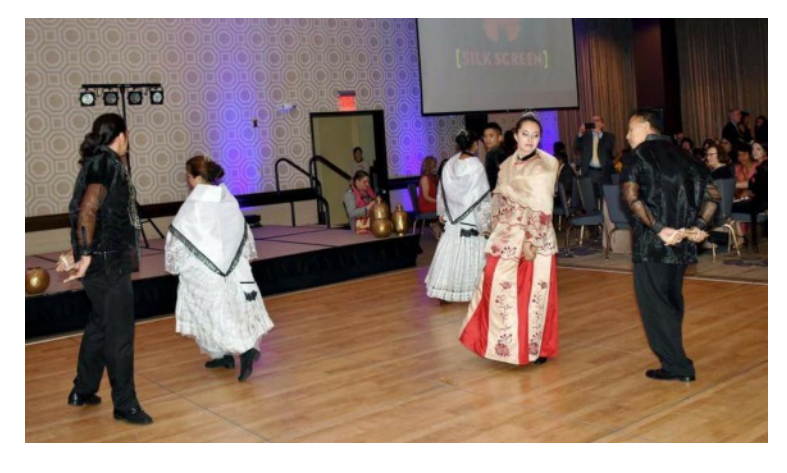
FAAP at the Silk Screen Red Carpet Gala

FAAP officers and members also attended and volunteered at the Red Carpet Gala on Sept. 15 to kick off the festival. A performance by the FAAP Dance Troupe was part of the diverse entertainment.