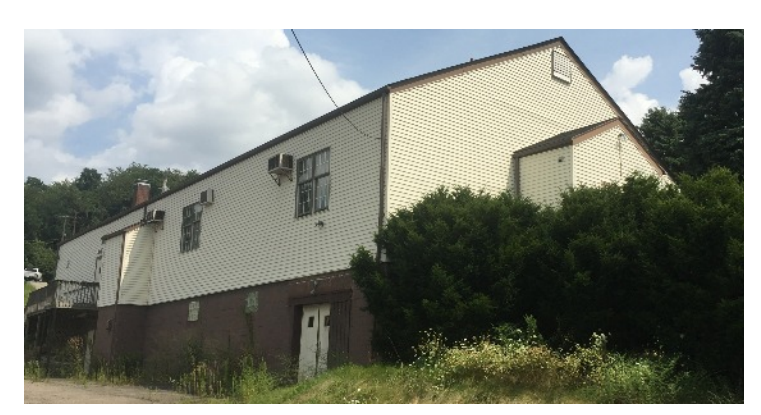
Site of future Philippine Center