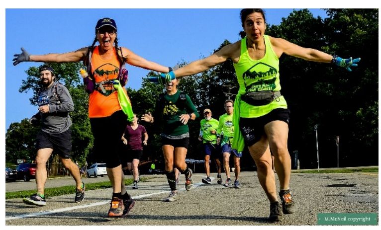
Runners at the 2017 Fall Classic

The race continues to grow in popularity among the running community. I believe it is the perfect activity to display our culture and our charitable efforts to the broader community.