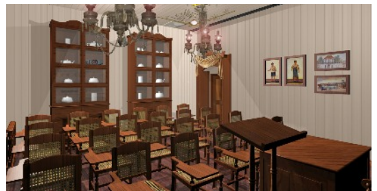
Rendering of planned Philippine Nationality Room

Great news! The Philippine Nationality Room project is moving to the construction bidding stage. This was announced at the Sept. 25 meeting at the University of Pittsburgh attended by representatives of the university, WTW Architects, and the PNR Task Force. This milestone was reached when it was clear that the estimate of $507,000 for construction cost was going to be achieved.